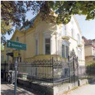
Vienna (Flow House): Neighbors include the house in which Beethoven composed his Third Symphony.