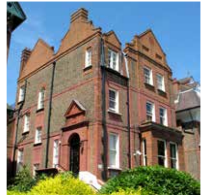
London (Worrell House): A quick area tour will take you to places that have been home to the creators of James Bond, Winnie-the-Pooh and psychoanalysis.