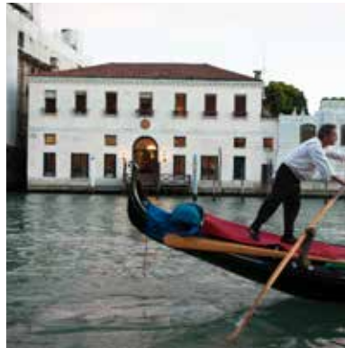
Venice (Casa Artom): For more than 50 years, Wake Foresters have learned in a house on the Grand Canal, one of the world's most iconic locales.