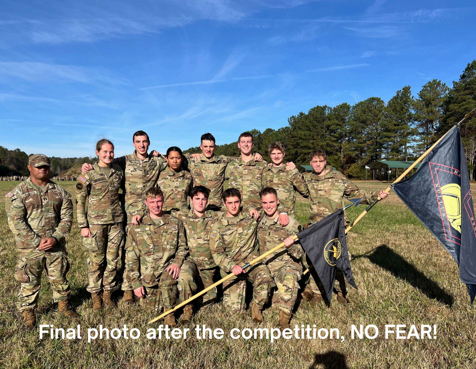
Final photo after the competition, NO FEAR!