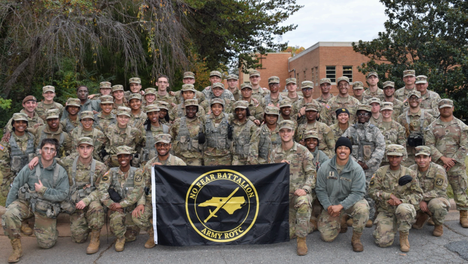
No Fear post-FTX photo!