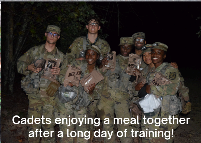
Cadets enjoying a meal together after a long day of training!