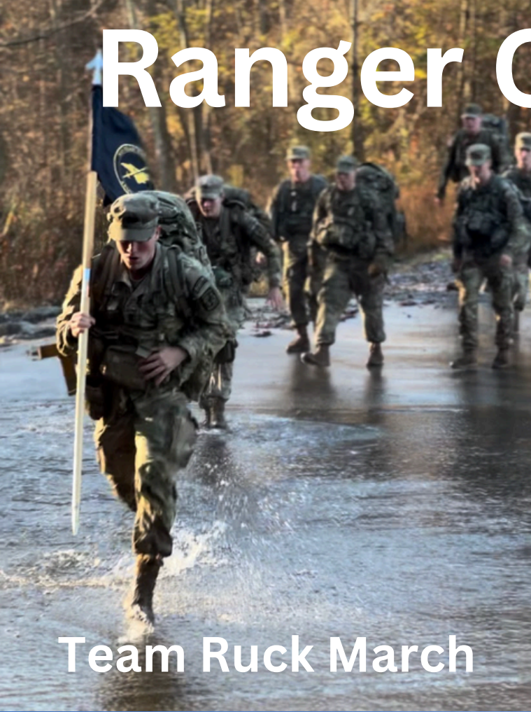
Team Ruck March