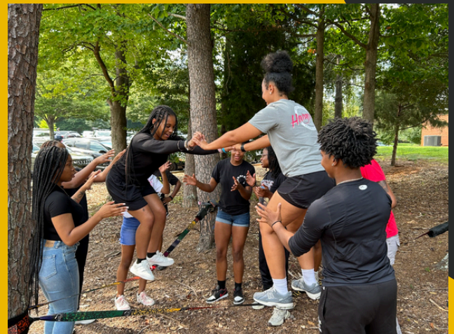
Top Left: Army 10-Miler Team