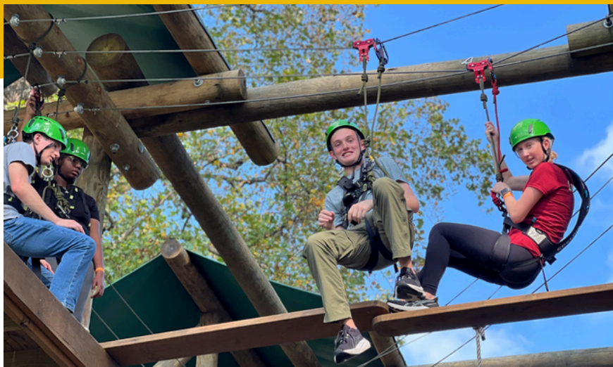
Bottom Left: High Ropes Course