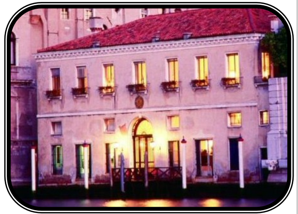
WFU Venice Program at Casa Artom

The dynamic of the academic environment of Salamanca really allowed me to pursue and develop my interests in Spanish history and art. I was able to investigate the discourse between art, architec-