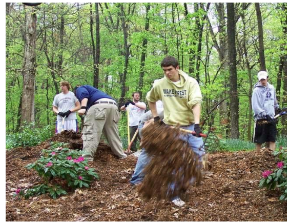
Fraternity members help mulch a campus natural area.