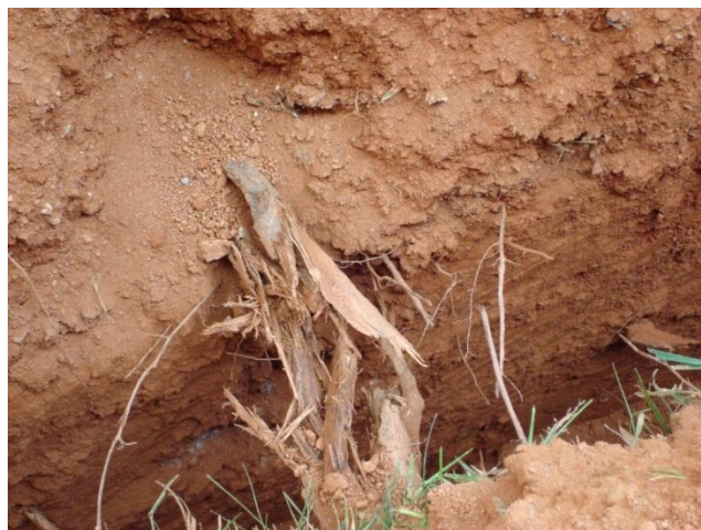
Improper trenching on South Campus resulted in severe root damage to this oak tree.