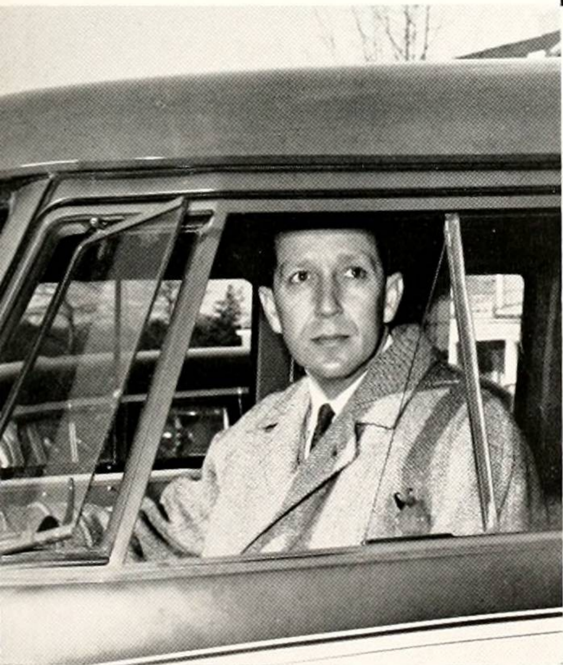
Off to plan a Nassau tour!