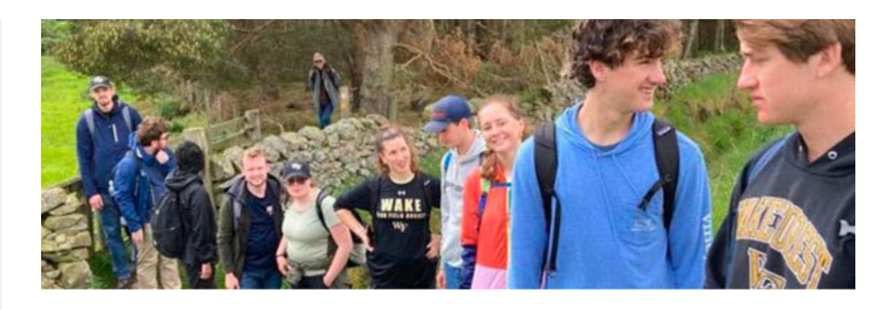
"Trekking St. Cuthbert's Way" Exhibition at stArt Gallery Opening Reception: Sept. 27, 4-6 p.m. stArt Gallery

A new exhibition, "Trekking St. Cuthbert's Way," opens at stArt Gallery. The exhibition highlights work created in conjunction with a class consisting of students trekking across the highlands of Scotland on the well-trodden path of the 1,400-year-old St. Cuthbert's Way. The exhibition features photography and digital artwork created on the trail and runs from Sept. 26 through Oct. 15. An opening reception will take place on Sept. 27 from 4-6 p.m.