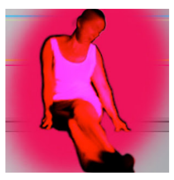
Swim: Lynn Book Archive March 22, 5 - 8 p.m. Scales Fine Arts Center (SFAC)

Join us for the public launch of the Lynn Book Projects Archive - an online portal to some 2000 digitized artifacts from the artist's 45-year corpus of experimental projects and research at the intersection of arts, culture, change. Free and open to