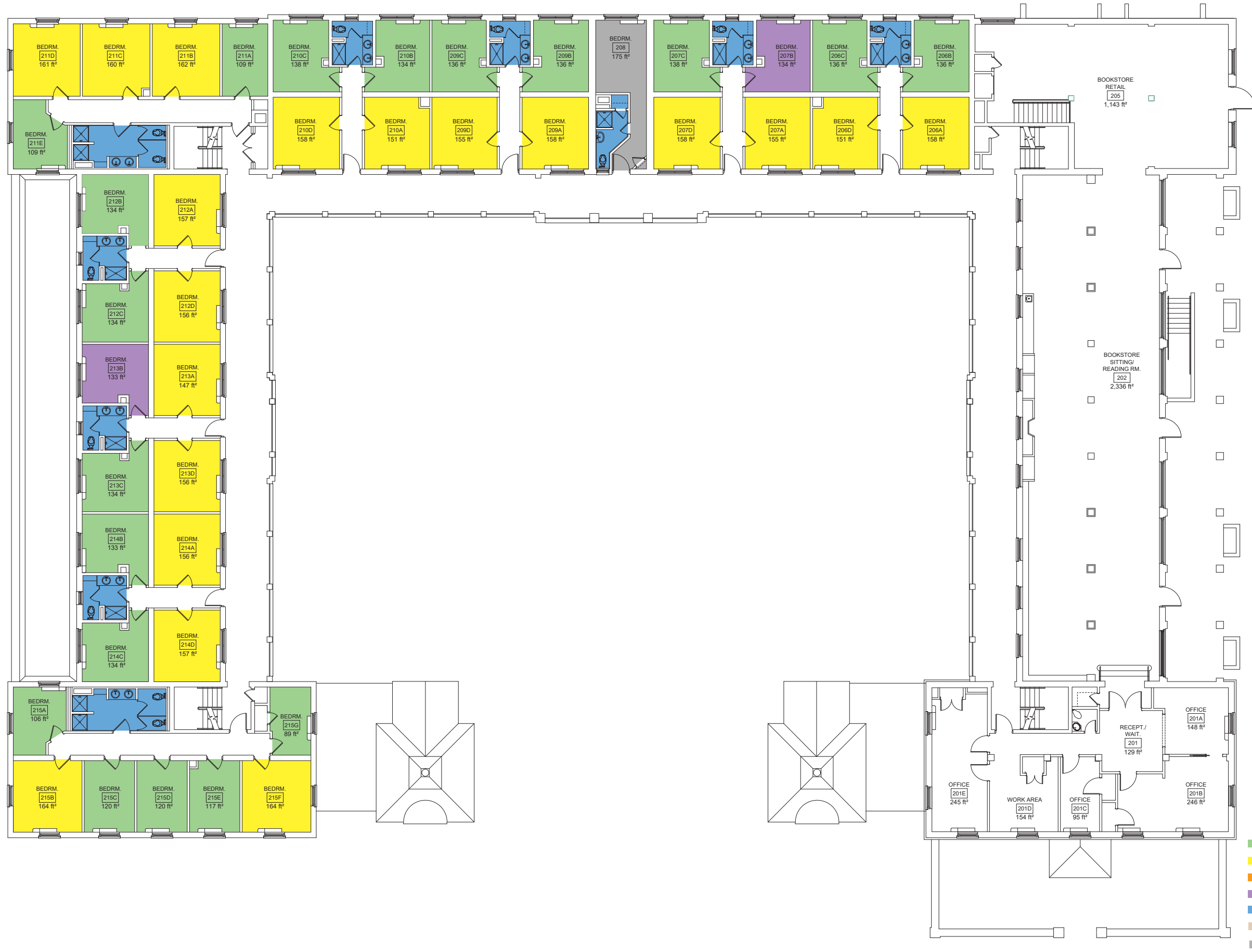
Taylor Residence Hall Second Floor Plan