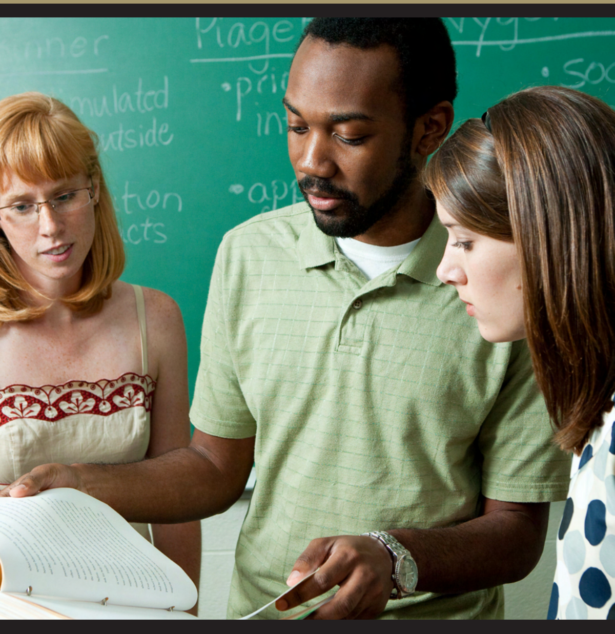
Bulletin of Wake Forest University