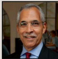
Claude Steele Professor of Psychology Stanford University

Designing Courses and Assignments that Contribute to Wake Forest's Slavery, Race, and Memory Project