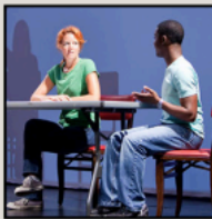
CRLT Players University of Michigan