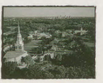
Wake Forest University Campus