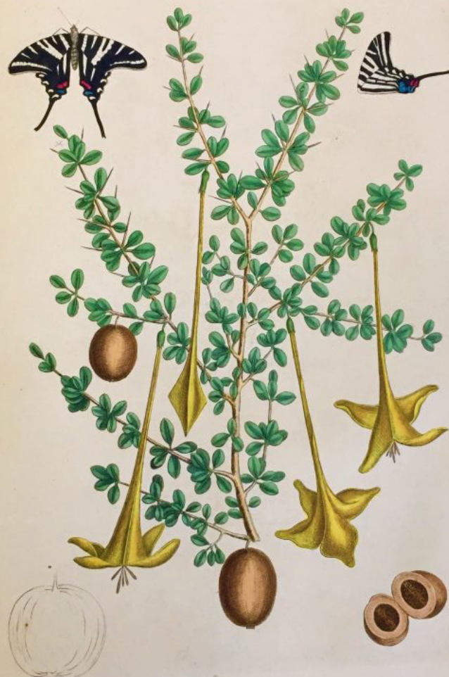
EXHIBIT FOR BOOKS, AUTHORS, AND READERS IN 18TH CENTURY ENGLAND Open now to April 1, 2020, ZSR Special Collections & Archives Room 625