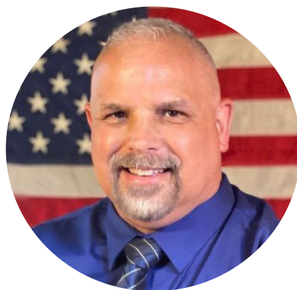
GOVERNOR: AL PISANO (CONSTITUTION)

You can learn more about the Dan Forest for Governor campaign here .