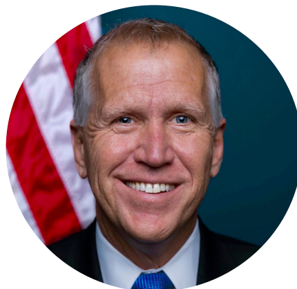
SENATOR: THOM TILLIS (R)

You can read more about Kamala Harris's policies and goals here .