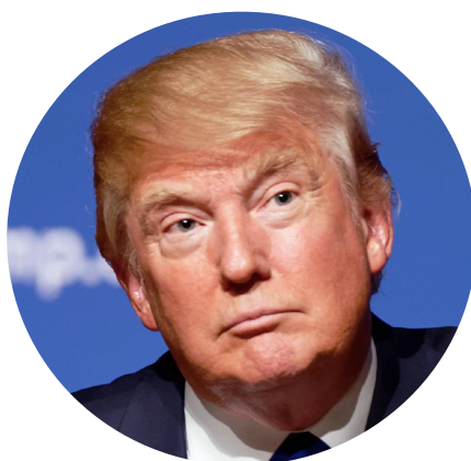
PRESIDENT: DONALD TRUMP - Republican (R)

President Donald J. Trump is the current incumbent, and is running for reelection as the nominee for the Republican