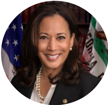
VICE PRESIDENT: KAMALA HARRIS (D)

In July 2016, Trump selected Pence as his running mate. You can read more about Mike Pence's policies and goals here .