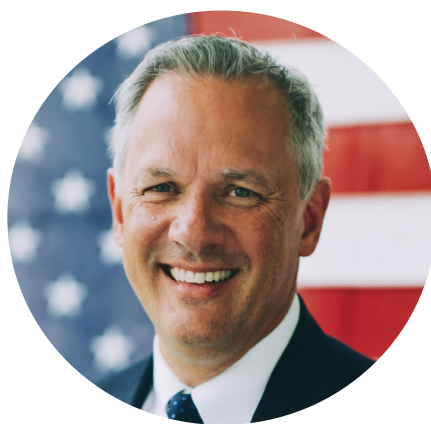
GOVERNOR: DAN FOREST (R)

You can learn more about the Roy Cooper for North Carolina campaign here .