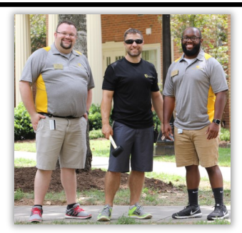
Amazing Team Work

F&CS will be preparing for this event weeks in advance in order to provide team members at each residence hall.