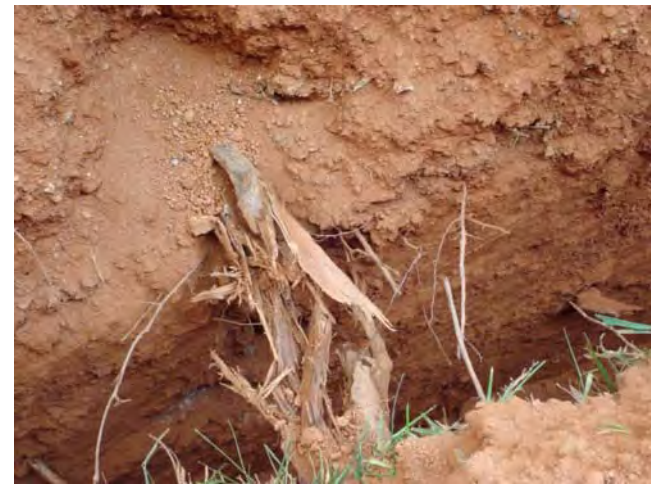
Improper trenching on South Campus resulted in severe root damage to this oak tree.

• Root Pruning: As with above ground pruning; trees benefit from clean cuts on their roots as well. Notify the Landscape Department or University Arborist when encountering roots during construction. The Arborist may want to prune these cleanly before backfilling occurs.