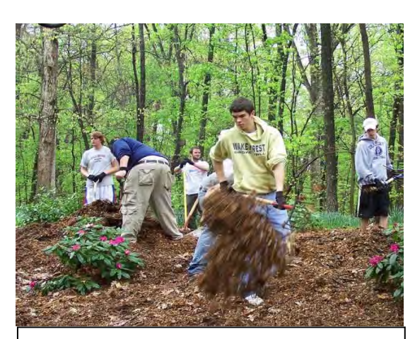
Fraternity members help mulch a campus natural area.