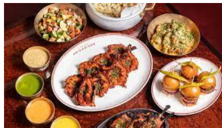
Ambassador General (London)