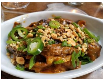
The Grey (Savannah)