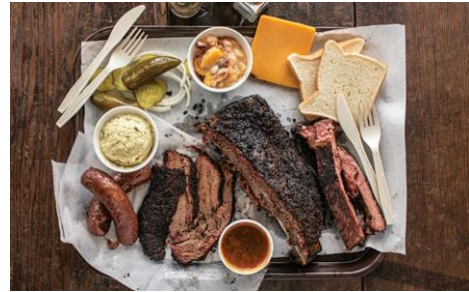
Louie Mueller BBQ (Taylor TX)