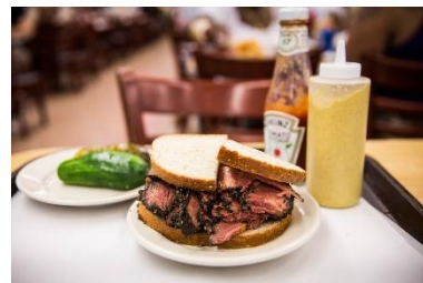
Langer's Deli (LA)