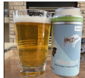
Stüber Tuff (PDX). In homage .