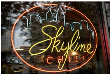
Skyline Chili (Cincinnati)