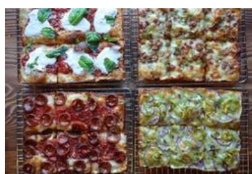
Emmy Squared (Bklyn)