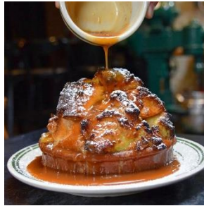
Antique Bakery (NYC)