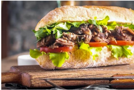
Parkway Po'Boy (NOLA)

2021 Food: Blessed pre-Delta window's memorable meals included Clancy's (NOLA), NYC's Rezdôra & Blue Willow, Salt (Great Pond USVI), & John Currence's Oxford MS latest, Bouré. COVID still meant much Winston takeout as well as UPS delivery from beloved spots below.