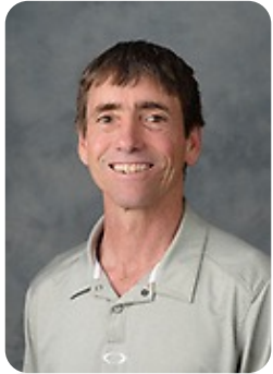
Gary Miller College