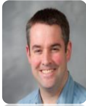
Jason Parsley College