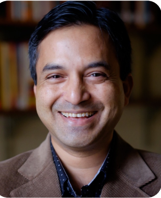
Raisur Rahman College