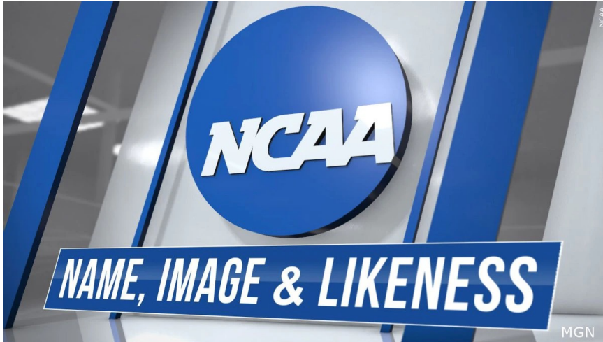
Name, Image, & Likeness (NIL)