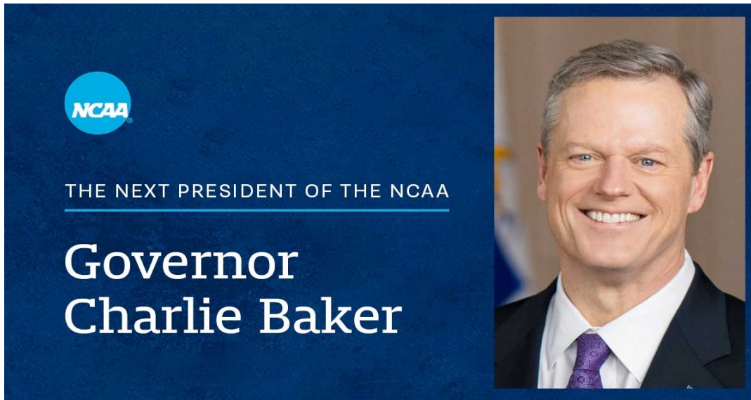
New NCAA President as of March 2023 Governor Charlie Baker (R-MA)