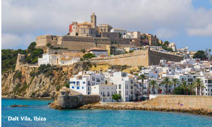
Dalt Vila, Ibiza