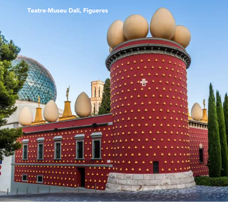
Teatre-Museu Dalí, Figueres