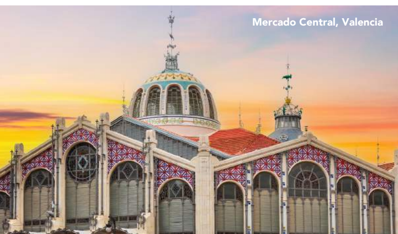
Mercado Central, Valencia

You will also visit the Mercado Central (Central Market), an exemplary showcase of Valencian Art Nouveau, where more than 300 stalls overflow with local delights. See the spectacular Gothic Valencia Cathedral, whose architecture ranges from Romanesque to Neoclassical. Within, visit the Chapel of the Holy Chalice, housing a first-century A.D. cup believed to have touched Christ's lips during the Last Supper. Before returning to the ship, discover the Museo de Bellas Artes de Valencia, Spain's second-largest art gallery, whose collection includes treasures by Velázquez, Goya, and Sorolla. Alternatively, marvel at the futuristic Ciudad de las Artes y las Ciencias, designed by Valencia-born architect Santiago Calatrava, with its six magnificent structures and a distinctive bridge. B,L,D