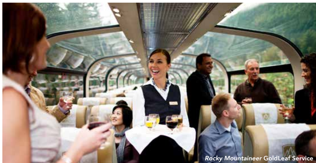
Rocky Mountaineer GoldLeaf Service

Activity Level: Guests should be comfortable boarding and disembarking trains without assistance, walking and moving between coaches while the train is in motion and navigating stairs to upper level of the coach. Guests should also be able to enjoy outdoor walking with sure-footing on uneven terrain, get in and out of a motor coach without assistance, and be able to manage stairs.