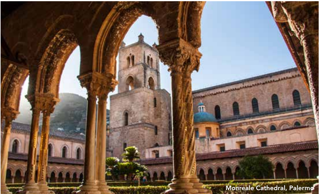
Monreale Cathedral, Palermo