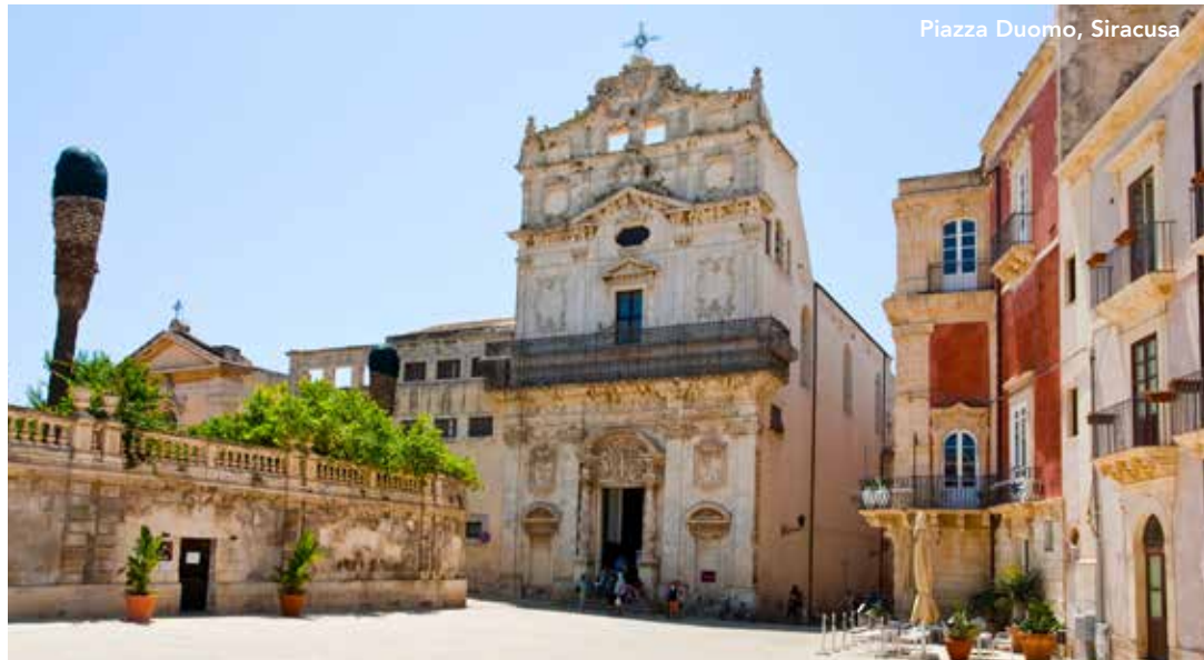
Piazza Duomo, Siracusa