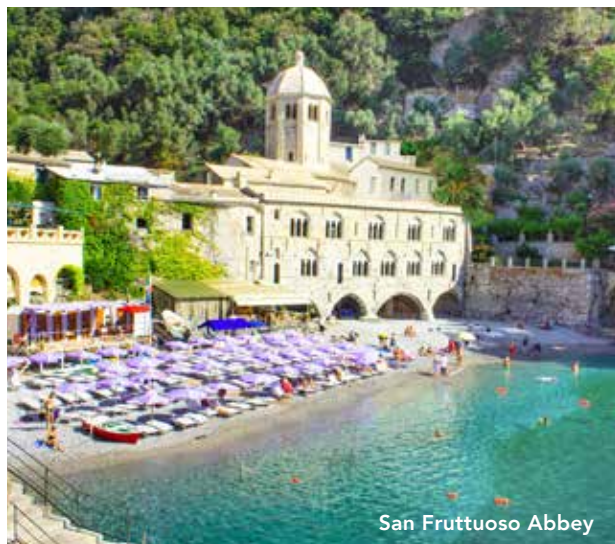
San Fruttuoso Abbey