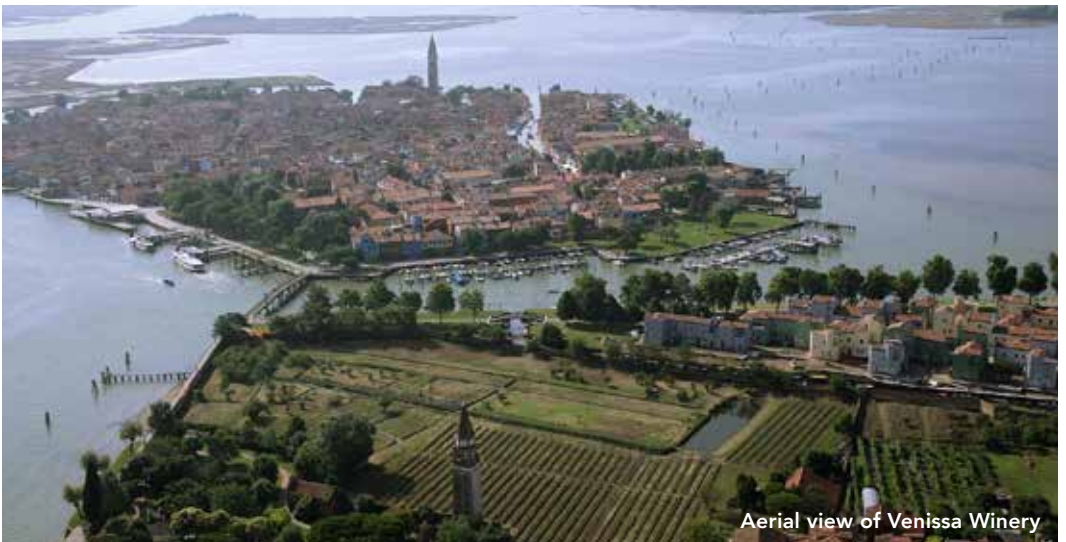
Aerial view of Venissa Winery