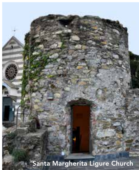
Santa Margherita Ligure Church