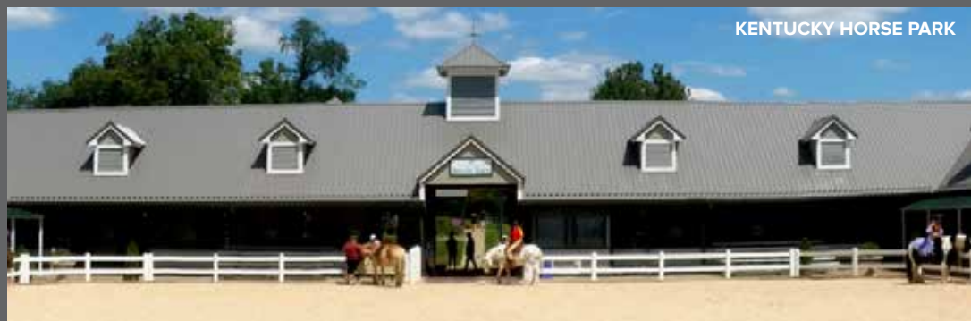
KENTUCKY HORSE PARK