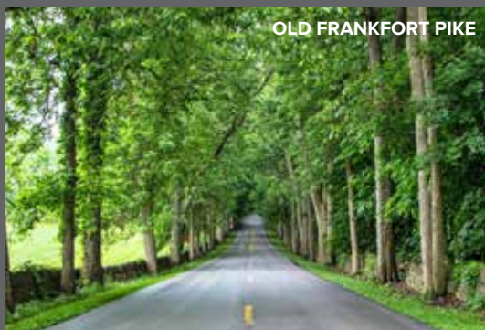
OLD FRANKFORT PIKE